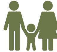
FAMILY YEARLY COST OF LIVING