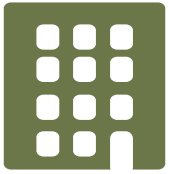
MEDIAN MONTHLY RENT