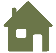
MEDIAN HOME VALUE