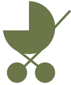
MONTHLY CHILDCARE FOR 1 FULL-TIME CHILD