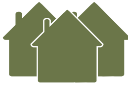
MEDIAN MONTHLY HOUSING